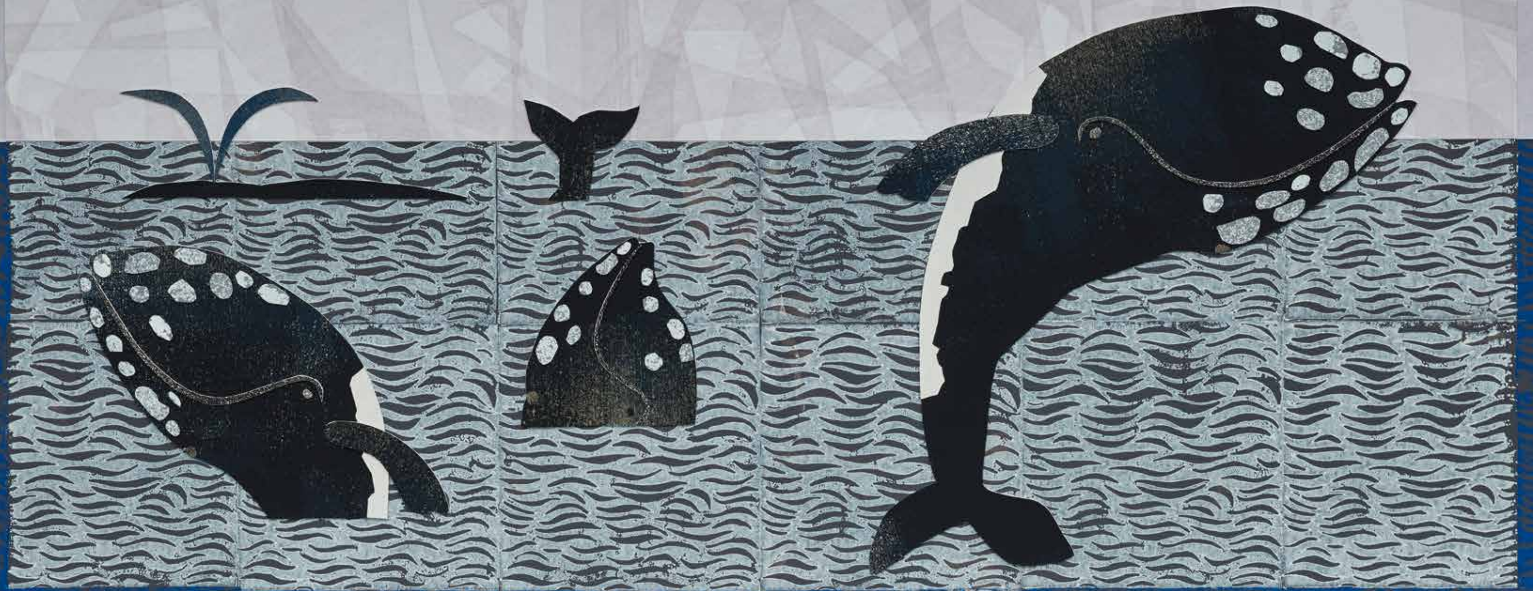
Four slow-paced, big-faced right whales