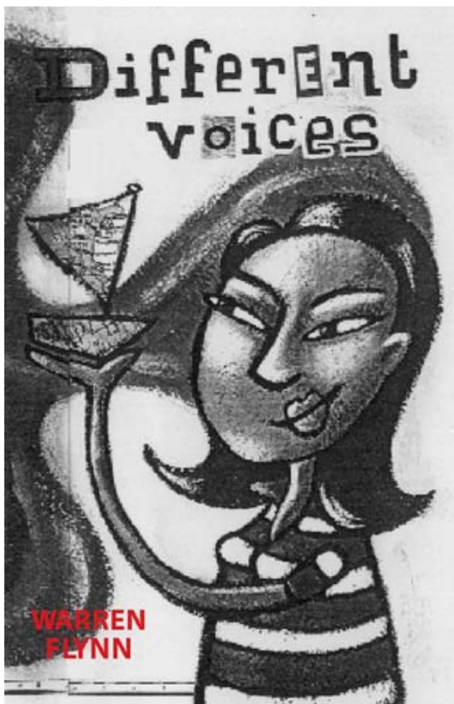
COVER OF THE ORIGINAL EDITION (1996)